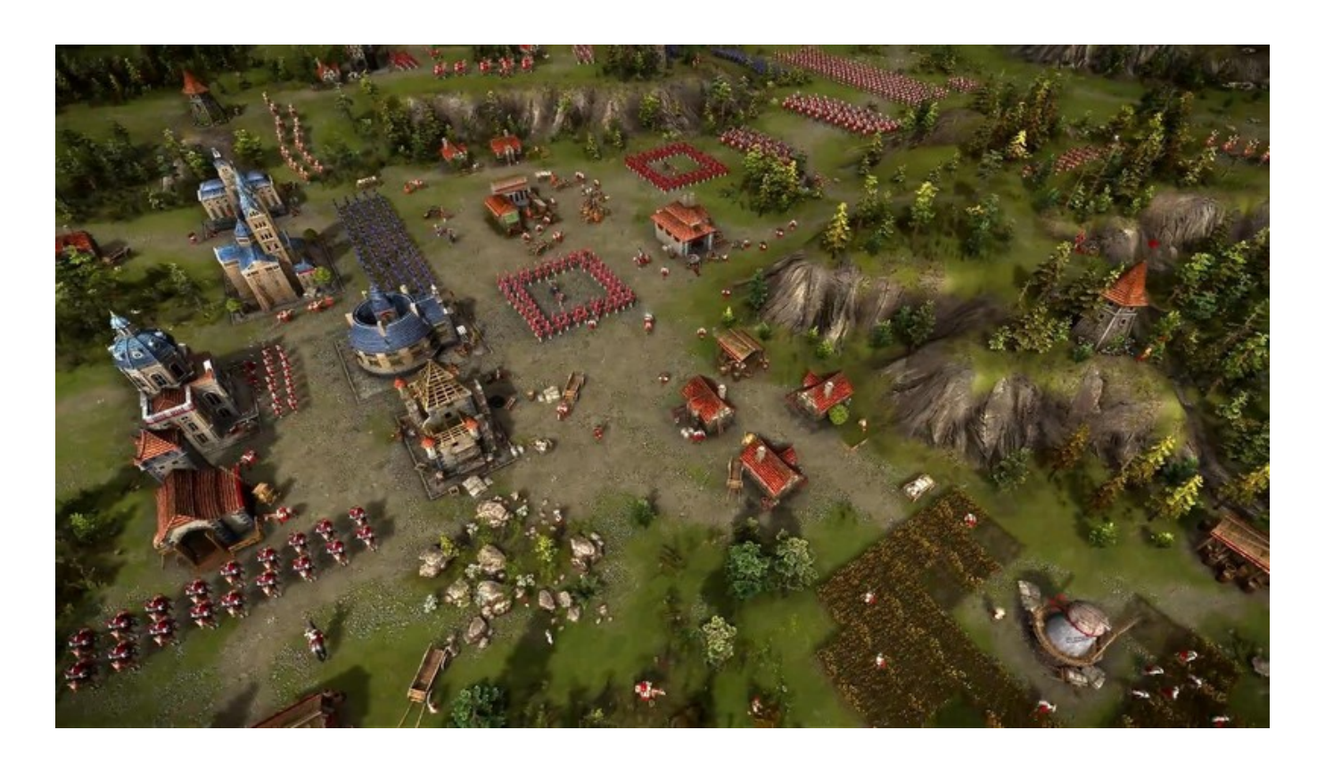
Flood Of Light Crack Download Free Pc

Download ->>> <a href="http://bit.ly/2NFVMQ7">http://bit.ly/2NFVMQ7</a>