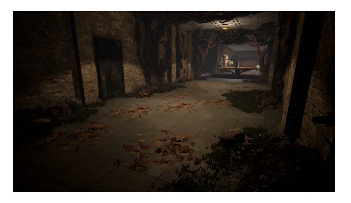
Tales Of Inca - Lost Land Download For Pc [cheat]